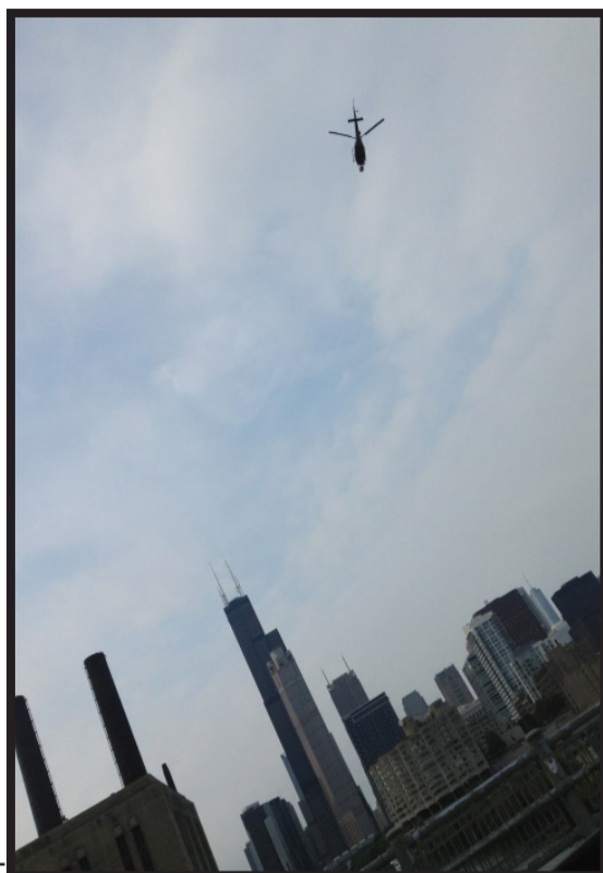
Helicopters film chaos over Chicago

For the past three months, Michael Bay and the Decepticons have been destroying the city and creating havoc all over town. Filming of Transformers: Age of Extinction started late August and wrapped up on October 6th. This will be the fourth installment of the Transformers franchise. Michael Bay also destroyed Chicago for Transformers: Dark of the Moon. This time around, he transformed parts of Chicago to look like Hong Kong, China, and Texas so don't get confused when watching the film.