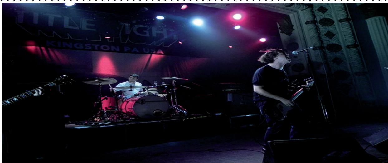
Title Fight performs.