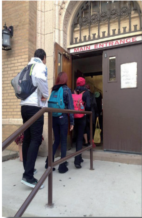
Students at the front entrance.