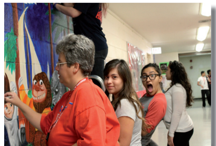
Hubbard students bond while painting.