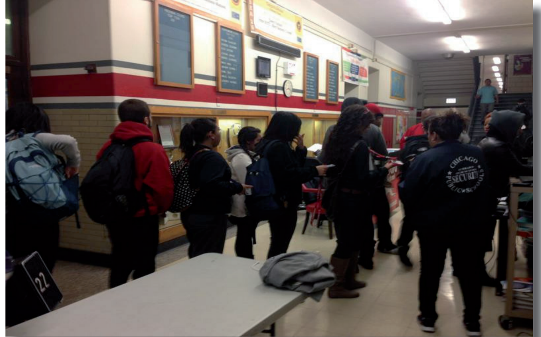
Tardy students swipe in.

Building a good foundation within your high school career will help you to build good habits of being on time, become responsible for your actions, and understand that with tardiness comes a consequence.