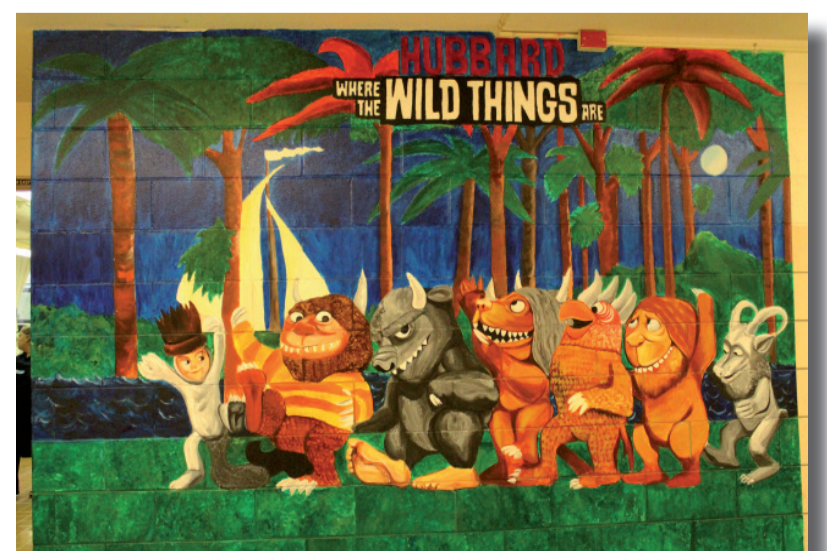
Where the Wild Things Are comes to Hubbard!