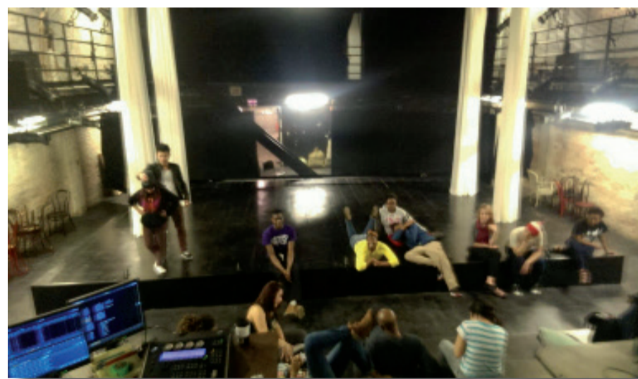
Gallery 37 students take a break from the program.

These young ladies both manage to keep their grades up at school and at Gallery 37, and do what they are passionate about. They recommended this program to anyone who has a deep passion for art, and whoever wants to experience it hands on training.