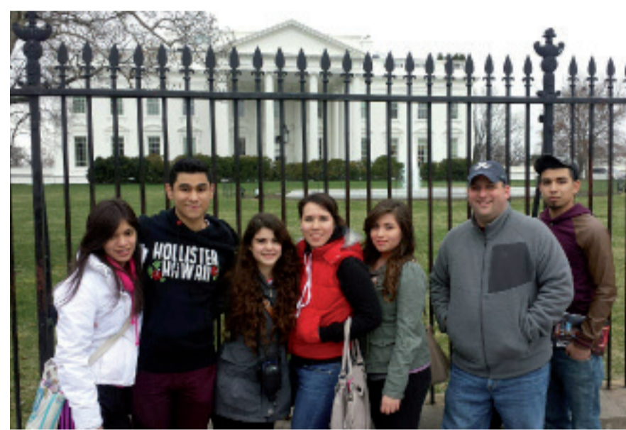
The Hubbard decathletes pose in front of The White House.

If you're looking for a club to join where you can get a chance to go to Washington, have the best coaches in the world, and interact with new people, then Hubbard's Academic Decathlon team might be for you.