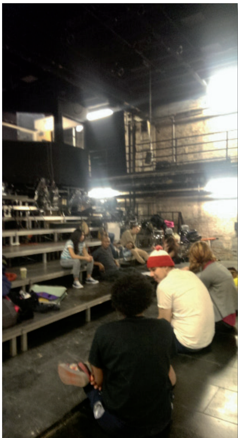
Students discuss their ideas with fellow artists.