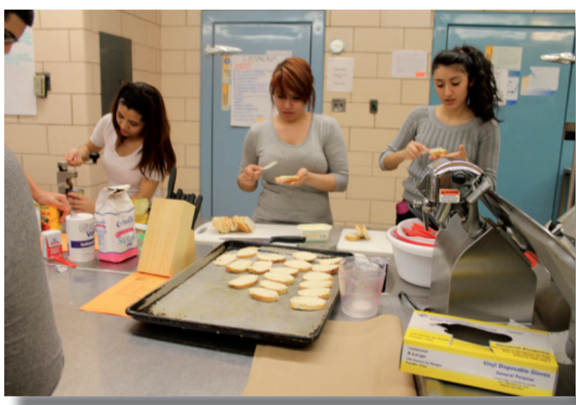
Cooking Club members preparing delicious garlic bread!

The club does its best in getting all the necessary supplies before they start cooking. It's no surprise that the club gets visitors very often that happen to roam the halls and catch a whiff of the days dish.