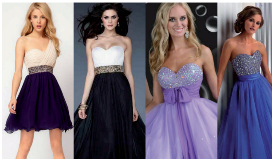
Different styles at Peaches and Davids Bridal ensure you'll find your dream dress.

Every girl deserves to go to prom since it's a once in a life time experience. However, prom can be very expensive for girls because of the hair, dress, and makeup. A great place to go to is the Glass Slipper Project. It is a charitable prom organization that provides prom dresses and accessories to girls who can't attend prom due to financial problems. The organization is available to girls once every year during the spring. You get hundreds of dresses and accessories to choose from. Keep in mind of your options, ladies. Start looking for the dress that will catch everyone's eyes before it's gone.