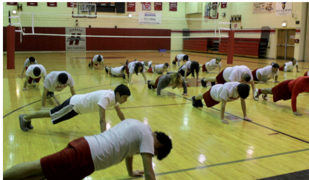
P.E. students participating in class.