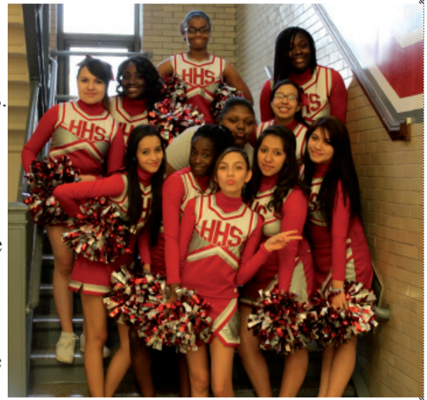
Pom Pon girls promise to raise school cheer.