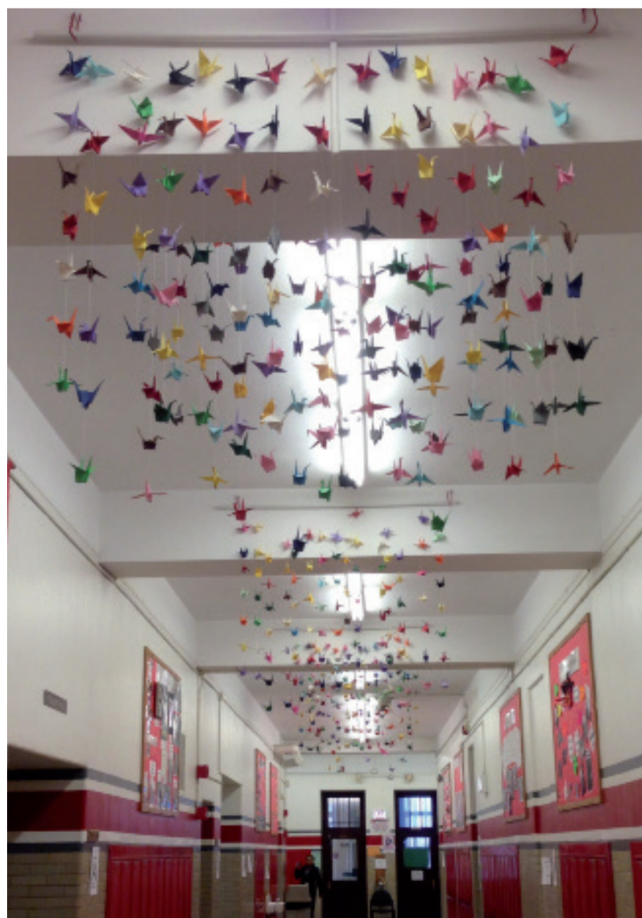
The cranes made by the art departments added beauty and culture to our hallway.