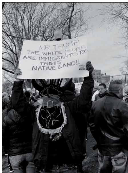
Protestors angry about new immigration policies

On February 16, 2017, hundreds of people in the City of Chicago gathered in downtown for a rally in support of immigrants. People were encouraged to take an absence of work and/or school and to avoid spending money to illustrate the economic, cultural, and intellectual contribution that immigrants make in the United States.